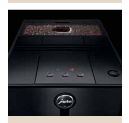
Compact design requires minimal space