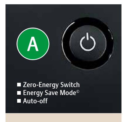
Kind to the environment